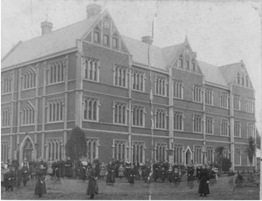
Christchurch 1882, demolished in 2012 after the 2011 earthquake