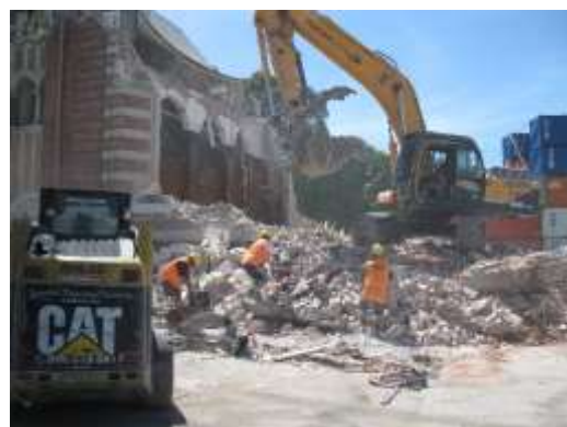
The last clearing of Ferry Road