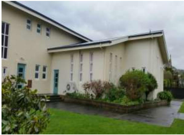
Petone Convent 2015 the day the Sisters moved out