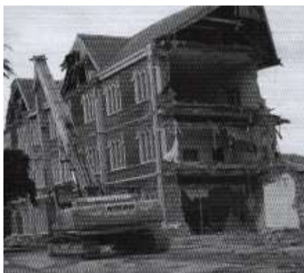
The interior of the Convent exposed after the Chapel and Cloister Hall had been removed

In February 2011 Christchurch suffered a large earthquake