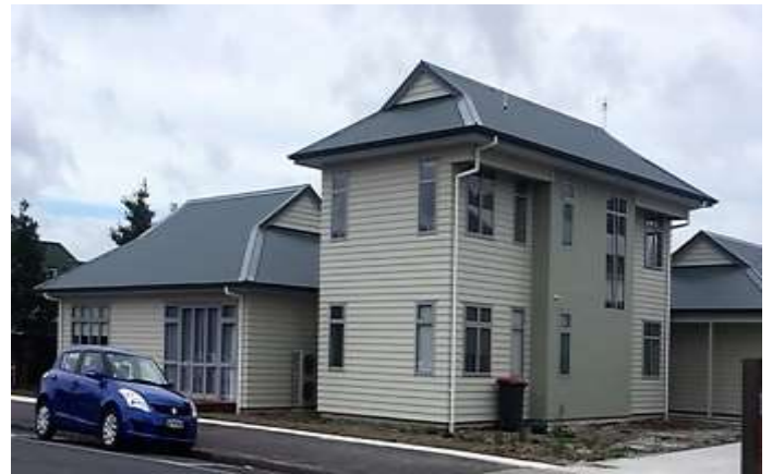
The new convent opened 2018