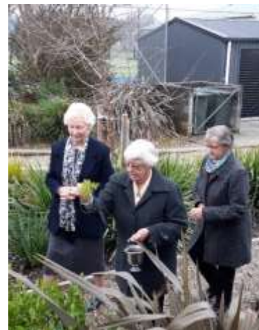
Blessing over the garden