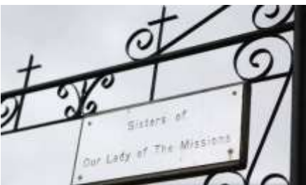
The sign for the Sisters of Our Lady of the Missions outside the present convent in Nelson