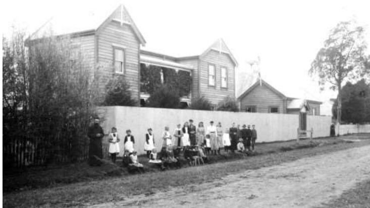
Early days in Opotiki

Before the end of the nineteenth century, convents had been established in Christchurch, Nelson, New Plymouth, Ashburton, Hamilton, Pukekohe, Opotiki, Leeston, Stratford and Rangiora. RNDMs were soon teaching in parish primary schools and in congregation-owned secondary schools. More often than not, they also cared for orphans.